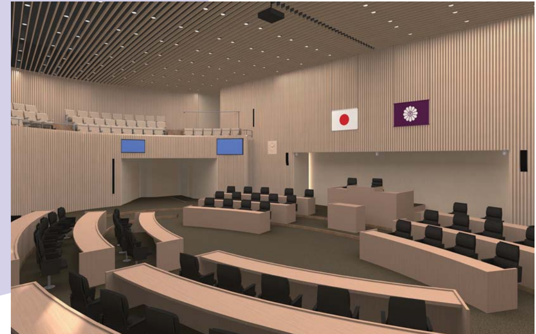
◀ Image of the city assembly hall (arranged for an assembly meeting)

Administrative functions have been enhanced to ensure thorough debate and investigations by the city assembly on various issues. The physical facilities of the assembly hall have been improved to give city residents better access to assembly meetings.