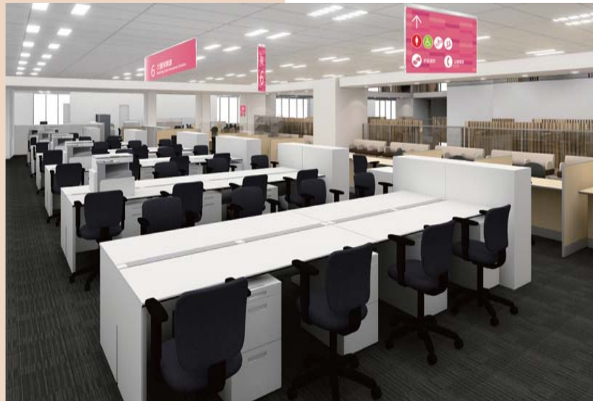
◀ Image of Office space

Office space for the staff is designed to help visitors to reach their destinations, featuring straight corridors and better visibility, ensuring worker-friendly streamlined spaces with no pillars. This will make it easier to carry out layout changes as well.