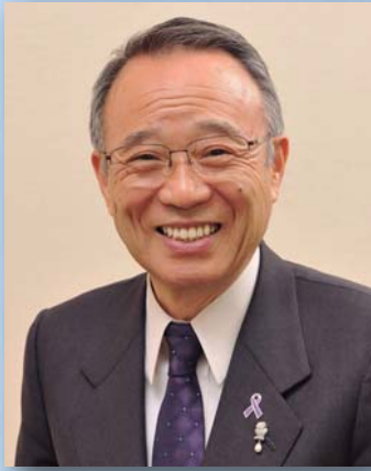
Mayor of Toshima City Yukio Takano